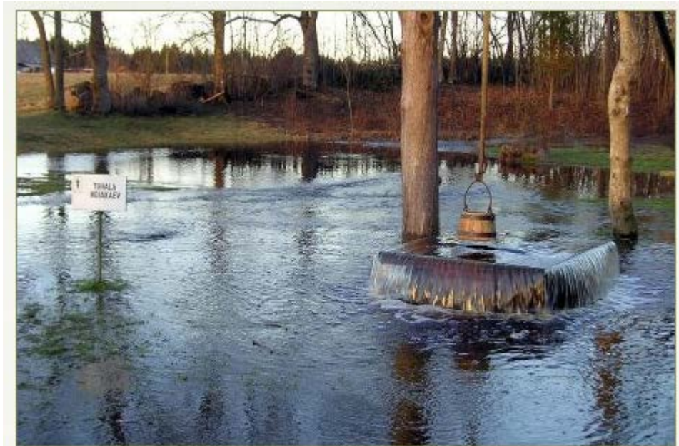
Tuhala nõiakaev keeb.